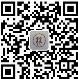
QR code of wechat official account