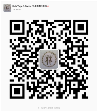
QR code of sign up wechat ccount

P.S. If students are absent on some days for his /her own reason, no refunds are available. Minimum 4 children to start class . If there aren't enough children, refunds are available. 5% discount is available for enrolling in both semesters.