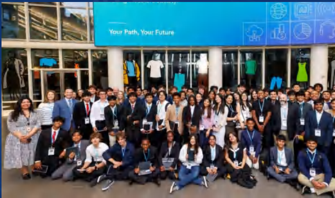
Past participants in the Global Round visited Bloomberg

As a leading global financial center, New York offers students a full immersion into its financial atmosphere. They will have the opportunity to visit top firms like J.P. Morgan and Bloomberg , iconic sites such as Wall Street , NYSE , and NASDAQ , and finance museums to experience the evolution of markets.